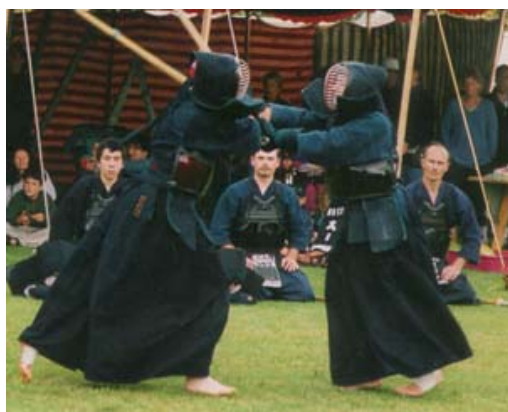
Hutt Kendo demo